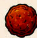
Fig Riccotta, Mozzarella, Proscuitto, Bacon, Canadian Bacon, Figs stewed in Marsala