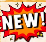
Fig & Pig $23/$27

Sweet Mexican Cream Sauce, Mozzarella, Cotija Cheese, Roasted Corn, Tajin, Lime & Cilantro